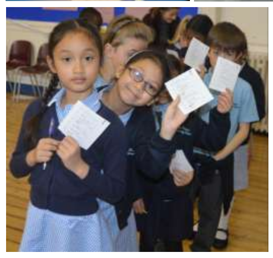
'The inclusive nature of the school embraces all cultures and abilities, and ensures everyone is valued' – Diocesan OFSTED inspection, March 2017